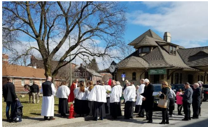
Palm Sunday Procession from Railroad Green to Christ Church